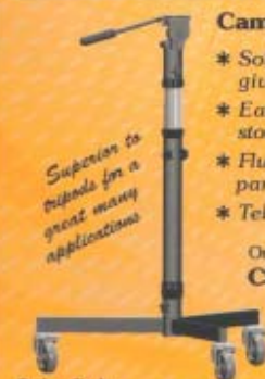
Order Code £ Ex Vat CS1000 397.65

Superior to tripods for a great many applications