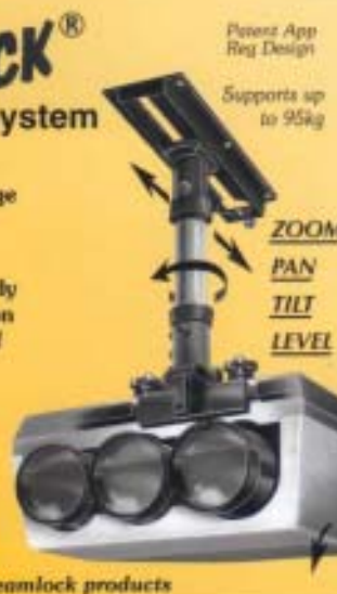
Patent App Reg Design

Interchangeable projector fittings allow easy changeover to other projectors.