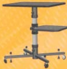
OHP Stand S/24/PC/AP £ Ex Vat 168.75