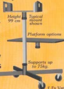
Standard Trolley Order Code £ Ex Vat T/32/EP 161.05

Wide choice of assembly options using any of the parts listed.