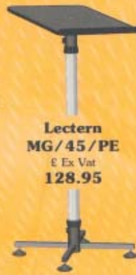
Lectern MG/45/PE £ Ex Vat 128.95