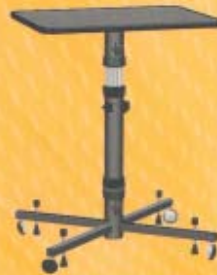
Telescopic OHP Stand S/2533/PC £ Ex Vat 171.10