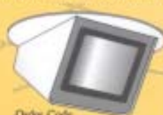
White gloss finish - other colour options available

Television monitor housings for public areas or security installations. Optional camera housing can be left or right.