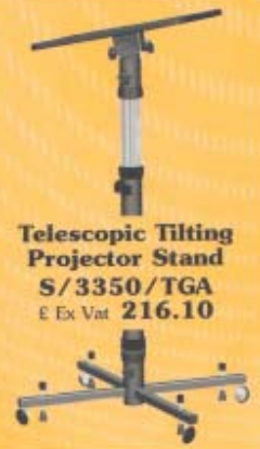
Telescopic Tilting Projector Stand S/3350/TGA £ Ex Vat 216.10