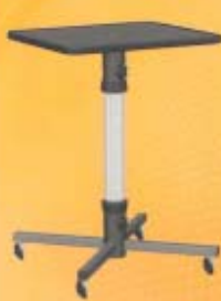
General Purpose Trolley M/24/PB £ Ex Vat 109.55