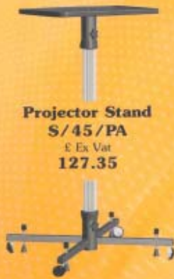
Projector Stand S/45/PA £ Ex Vat 127.35