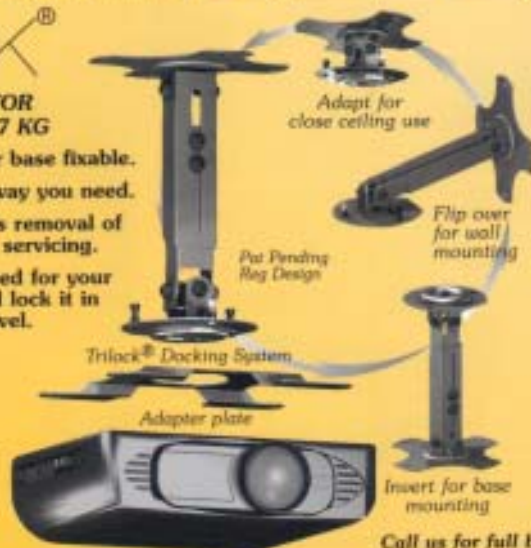
Adapt for close ceiling use