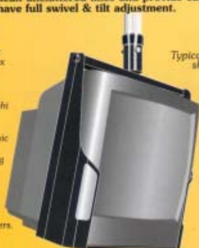
Typical mounts shown

Order Code Price Ex VAT MSU 171.90 * State TV make & model