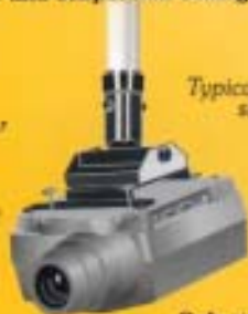
Typical mounts shown